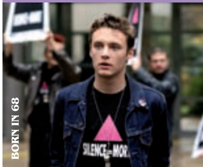
BORN IN 68

Peccadillo Pictures and the ICA on The Mall (Charing Cross) have teamed up with BOYZ to offer an exclusive £1 off any of these sexy 'n' cult LGBT films on show in this week's POUT film season. Just show up with this voucher at the ICA ticket desk to claim your discount. Max 2 discounted tickets per voucher. Check www.peccapics.com for more info.